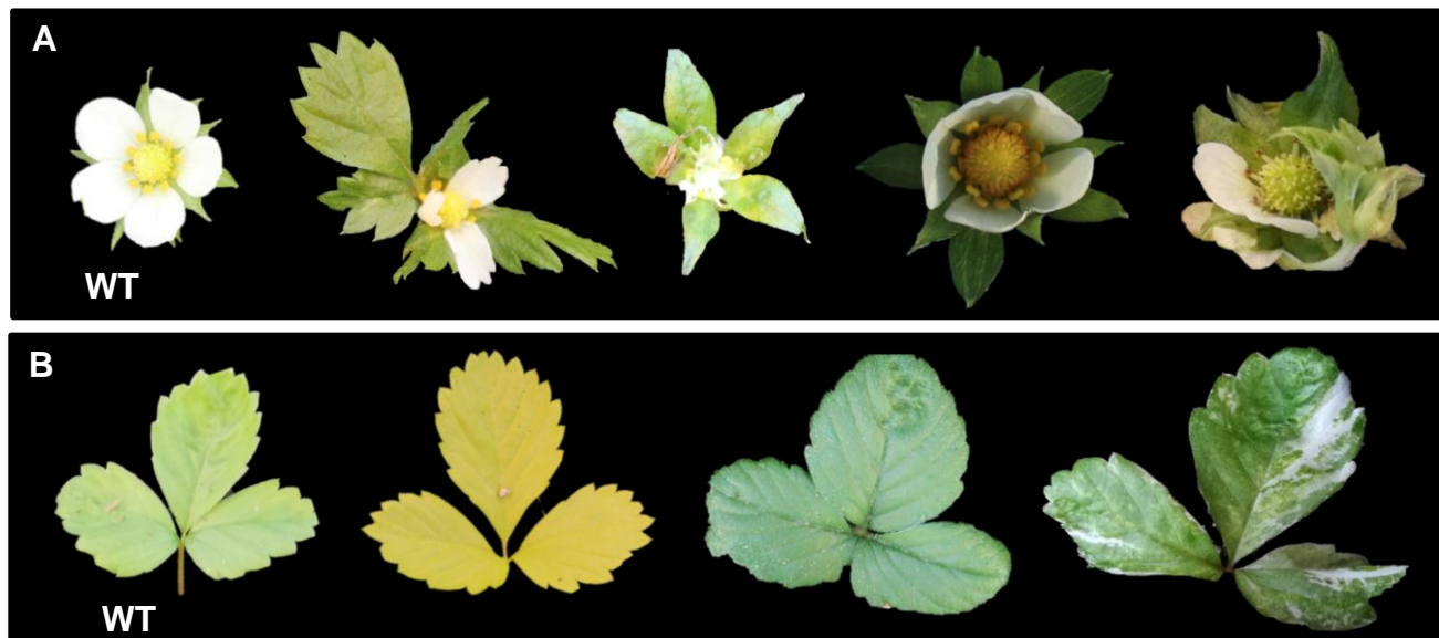
Figure 4. Examples of some mutant flower (A) and leaf colour (B) phenotypes observed in an ethyl methanesulfonate population of Fragaria vesca .

Finally, two EMS concentrations were trialled, (0.4 % for 4 h) and (0.4 % for 8 h), and the percentage of M 1 plants displaying chlorotic sectoring was 8.4 % and 13.4 %, respectively. These M 1 plants were selfed and the M 2 generation has been sown and is ready to be screened for increased or decreased susceptibility to B. cinerea . The EMS mutagenesis was successful, with mutations effecting the leaves and flowers of the M 2 generation (Figure 3).